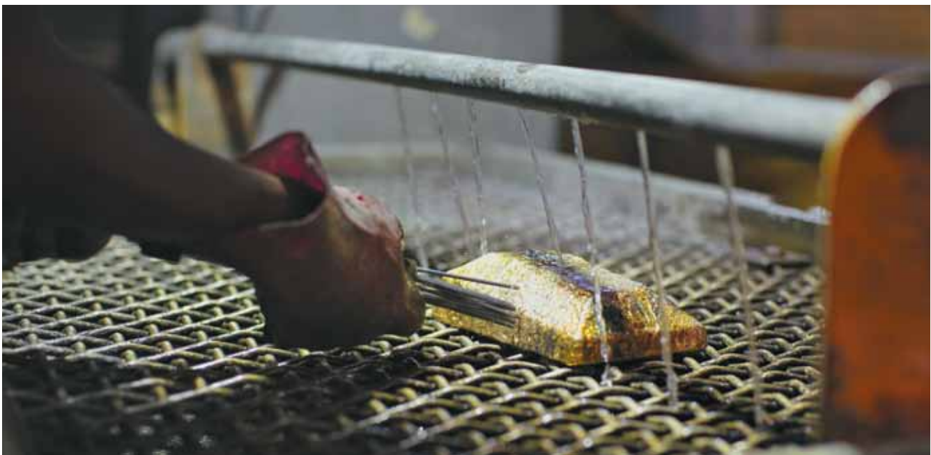
Cleaning a doré bar.

The European Union , within the context of its overall work on trade and development and raw materials policy, has stated its intention to produce proposals on improving the traceability of minerals.